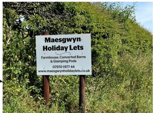
RETRACE YOUR STEPS TAKING IN THE VIEWS ALL AROUND ON YOUR DESCENT