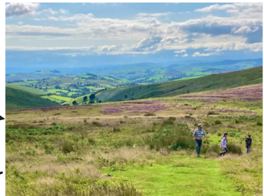
THE VIEWS LOOKING BACK OVER SOUTH WALES