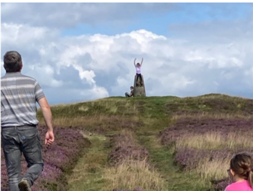
THE TRIGG POINT COMES INTO VIEW. ONE FINAL PUSH TO BE REWARDED WITH 360 DEGREE VIEWS OVER SEVERAL COUNTIES AND SNOWDON AND PEN Y FAN CAN BE SEEN ON CLEAR DAYS