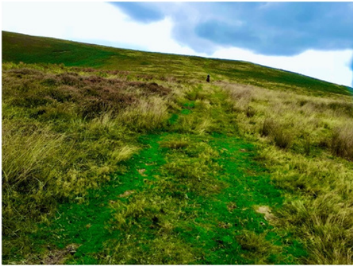
THE PATH CONTINUES UP THE HILL WHERE YOU MAY NOTICE A SMALL STONE ON THE RIGHT KNOWN AS A MILESTONE