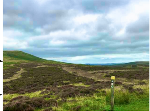
THE THIRD AND FINAL MARKER BEFORE THE FINAL CLIMB TO THE TRIGG POINT WHICH BEARS OFF TO THE LEFT