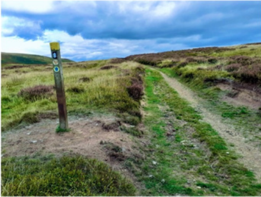
THE SECOND MARKER GUIDING YOU ALONG GLYNDWRS WAY