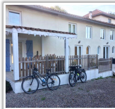
Touring Cyclists heading to Portugal

We have had a good 2021 despite the obvious difficulties with travel. We have met lots of lovely guests from all over France and indeed the world. Since we opened, we have had guests from the United Kingdom, Belgium, Switzerland, Germany, Portugal, Croatia, Spain, Holland, and even Brazil and Senegal!