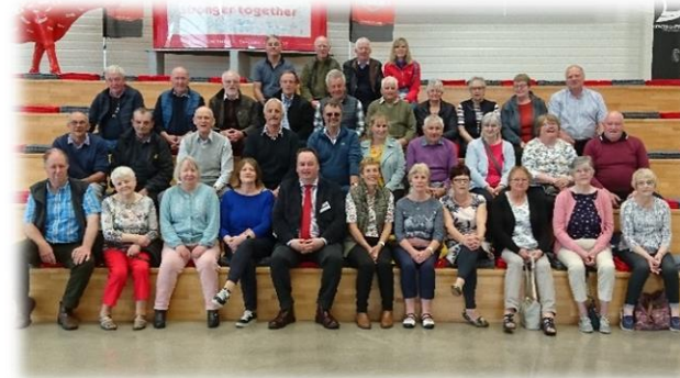
Upper Severn Grassland Society