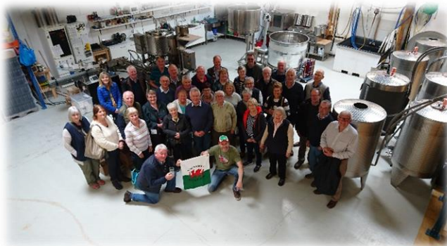
Upper Severn Grassland Society