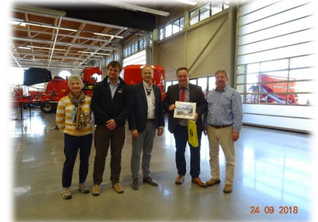
Brecon & Radnor NFU