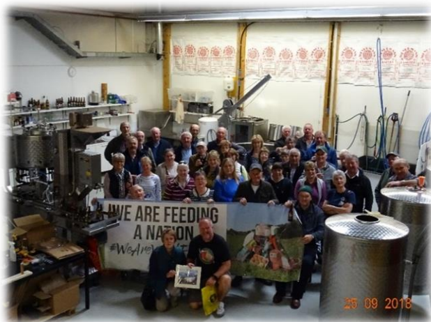
Brecon & Radnor NFU